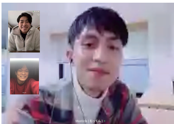
online interview ↑

So, from March to November, I did nothing. I was just waiting until I become able to move to Japan.