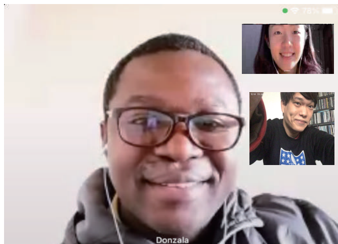
online interview ↑

I think Saga is a lively city. I am enjoying my life in Saga. I got used to this condition. I mean wearing masks and keeping distance from people are a part of my habits now. For instance, if I forget to wear a mask and go out, I notice this immediately because the wind hits my nose. Then I quickly go back to get it.