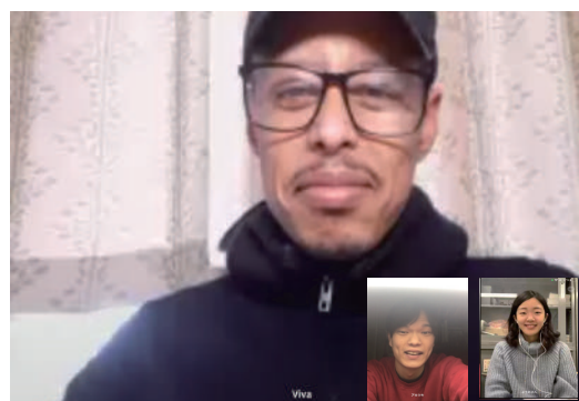
online interview ↑

I like it. I have a good tutor and good friends. It's early to say this but it's good and I'm still adapting.